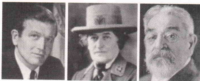
THE PANEL OF EXPERTS Famous. Well Respected. Not Happy.

When we heard that, we here at aef/fyi felt it was our duty to investigate. We wanted to see what could have inspired such passionate ravings from a such a distinguished group of, well, of stuffed shirts. The first step had to be to check the facts at AEF Galactic Headquarters Warehouse: Was there really THAT MUCH heater cable there? We were shocked at what we saw---over 63,000 feet of heater cable!! Eleven stinking MILES!!! Maybe they ARE Fools. But in the interest of fairness and good journalism (and also because they sign our paychecks) we decided to interview a top AEFer to get their side of the story. (Continued on page 3.)