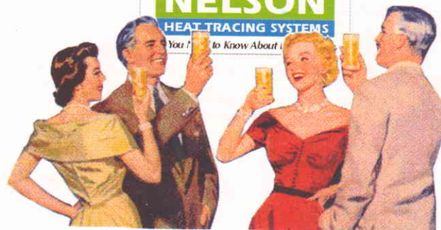
The "In Crowd" knows how to make Freeze Protection Swing!