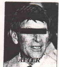
Actual Un-Retouched Photos of an AEF Customer's head prove that AEF's enormous local inventory of heater cable and accessories not only stops hair loss, it actually restores new growth! (Unfortunately it seems to work for customers only; no effects have been observed in AEF employees.)