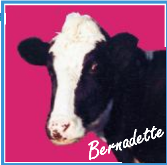
Bernadette The AEF Sales Answer Cow