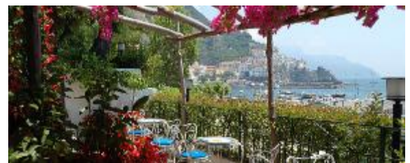
Heater cable from TEAM AEF will make your pipes feel like they're in Amalfi. If you're lucky maybe they'll send you a postcard.