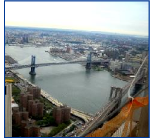
VIEW TO A THRILL: Looking down at the East River bridges (l-r: Willie B and Brooklyn) from the top of 8 Spruce Street. AEFers Wes and Pietro enjoyed(?) many trips on the construction elevator duct taped to the side of the building.

Architect Gehry has not yet seen the view from the top --- he was leery of riding the construction elevator that's attached to the building's west facade; he's waiting for the building's residential elevators to open. AEFers Wes Rayburn and Pietro Fasolino were braver, taking the ride up to finalize heat tracing for the cooling tower, and provide time-and-money saving installation instructions to the electricians. (Two of the building's six CM monitor panels are installed on the roof.) (Go to 2)