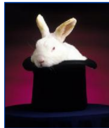
Pulling a rabbit out of a hat is child's play. Try pulling 600 transformers out of thin air!

You don't need a SuperStorm to be able to benefit from Central Moloney's experience and independence. Isn't a company that can deliver twelve tractor-trailer loads of transformers (almost) overnight the kind of company you'd like working for you?