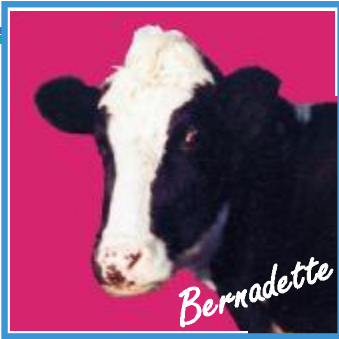
Bernadette The AEF Sales Answer Cow