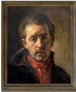
Self Portrait - 1935

Henricus van Meegeren was the most famous and successful art forger ever; so good, in fact, that if he hadn't confessed to his forgeries they would never have been discovered.