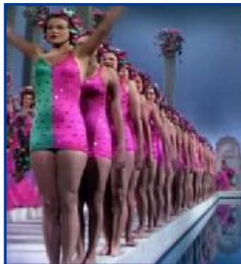
The graceful AEFettes make a Big Splash at Opening Ceremonies of the revamped AEF website!

Why not drop everything and visit right now!