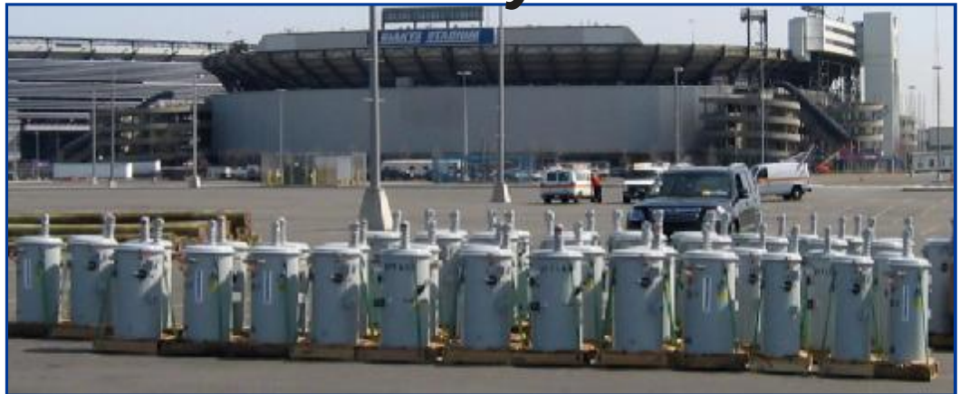
A few of the 600 Central Moloney Transformers that Saved New Jersey

March's SuperStorm did all kinds of damage; 60 mph winds knocked out power for half a million customers in AEF Land. New Jersey was hit especially hard: one local utility had 450,000 customers without power. The "worst storm in the company's history" was especially unkind to utility poles and the transformers mounted on them---over 350 poles were knocked down completely, and many others damaged.